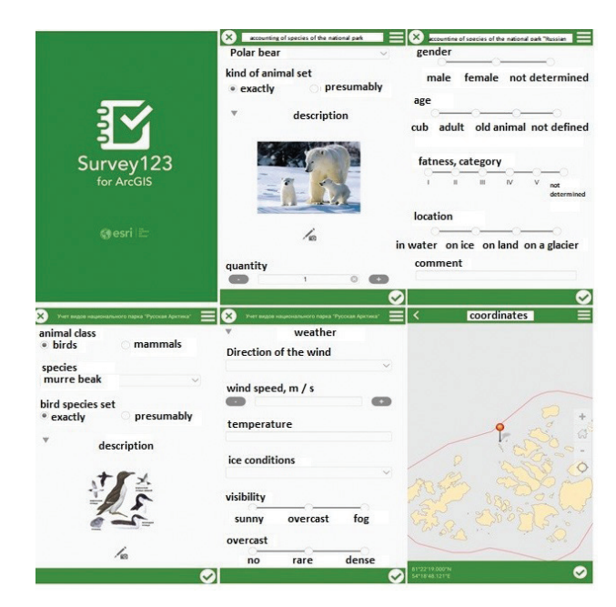
Figure 1. The interface of the animals counting form and weather conditions records.

Figure 2 shows the map of the encounters with white bears during the 2018 field season.