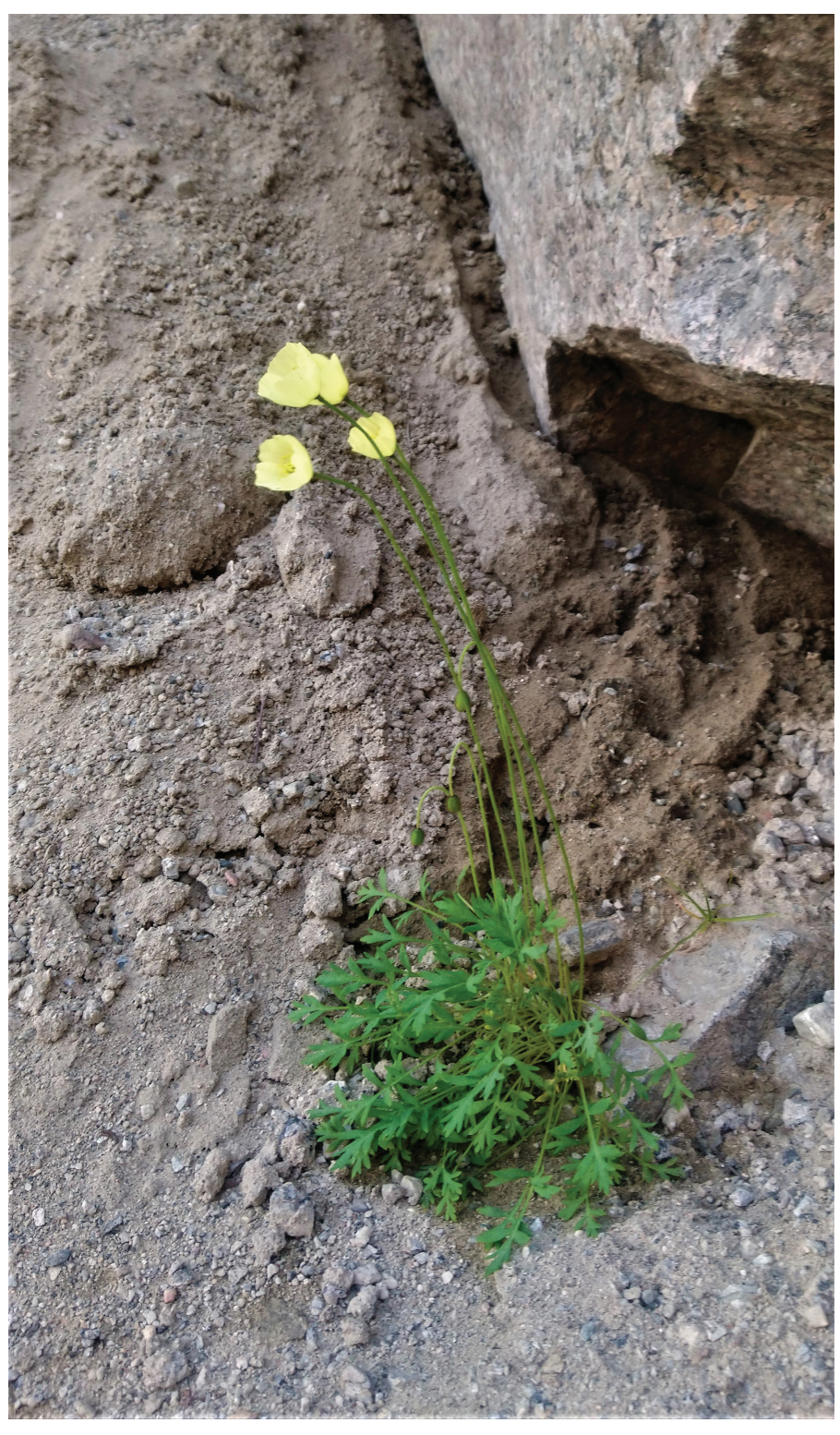
Fig. 3. Papaver lapponicum on the deluvium debris in the lower part of canyon. Lapland poppy is included to the Red Data Books of Russian Federation (2008) and Murmansk Region (2014). It occurs on destroyed habitats in all vegetation zones in Khibiny Mountains