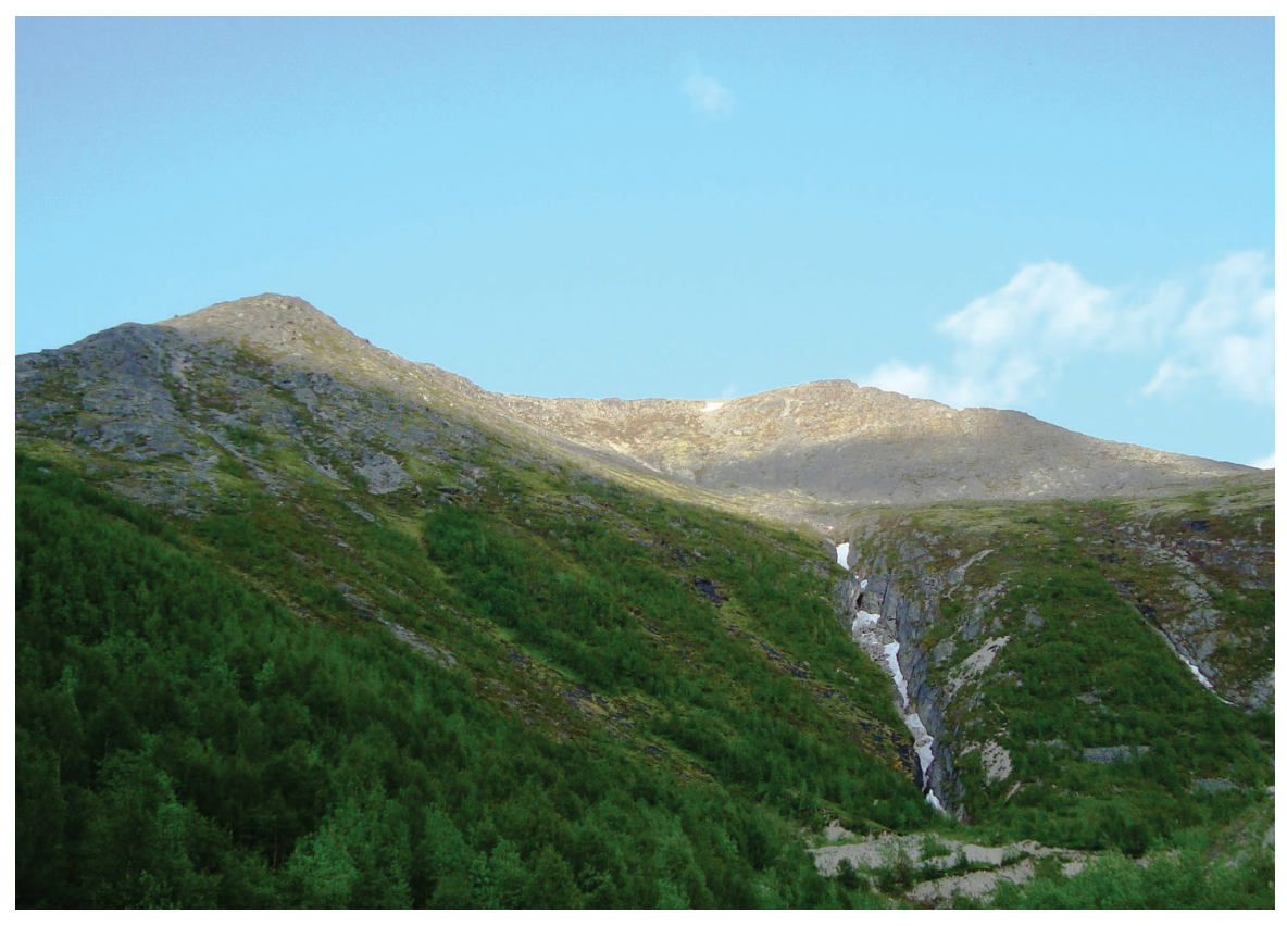
Fig. 1. View on the "Gorodskaya shchel' (Town Crack)" in the south exposed slope of Aikuaivenchorr Mountain. The canyon is blanketed by snow till the end of July; the slopes of cirque associated with canyon get partly snow-free in the beginning of June

The bulk of the Khibinsky Mountains is protected to-day as "Khibiny" National Park. The first proposal to establish a protected area here dates back to the 1920s. In 1917, V. Semenov-Tyan-Shansky (1870–1942), an esteemed Russian geographer, proposed to create a nature conservation park "on the model of the American national parks" in Khibiny. In 1931, the Polar-Alpine Botanical Garden was established in the valley of Bol'shoy Vudjavr Lake, the biggest lake in Khibiny, and now the nature protected area of Botanical Garden (1,670 ha). In 2018, National Park "Khibiny" was founded; its area covered the major part of Khibiny, about 78,400 ha. Four small protected areas (botanical nature monument) were organized in southern and central part of Khibiny, which was not covered by the National Park.