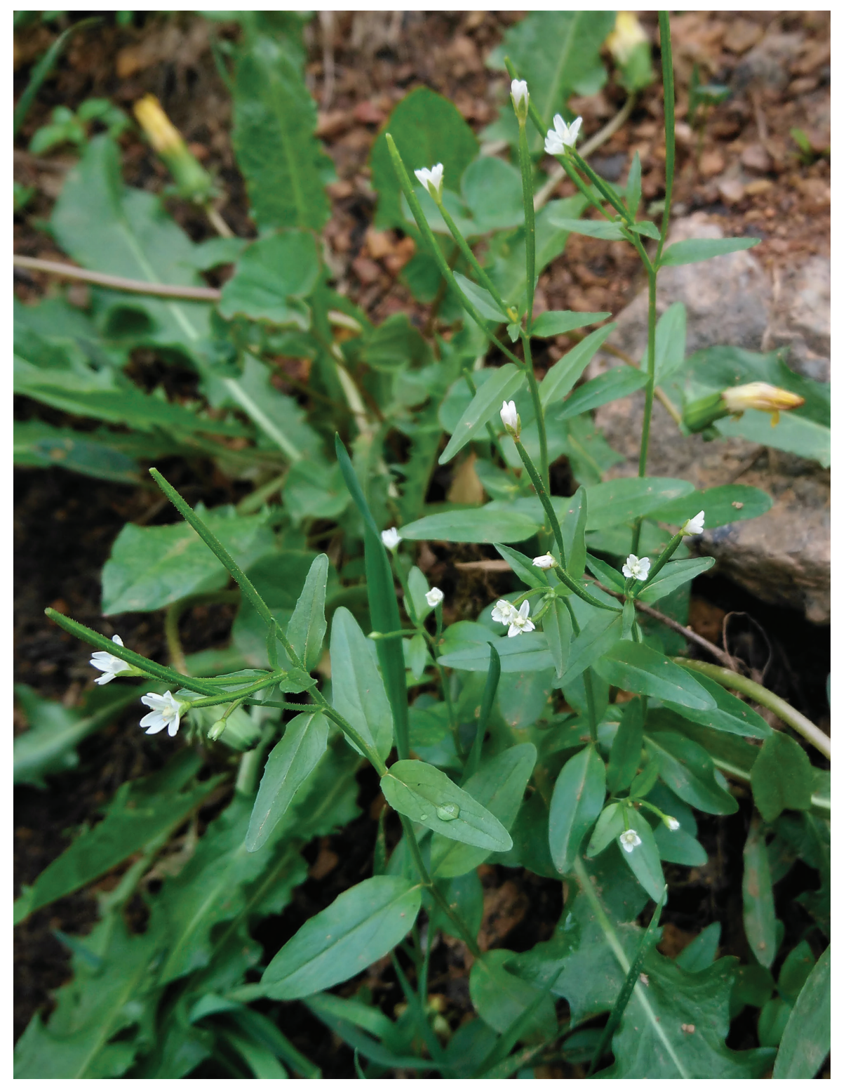
Fig. 2. Epilobium lactiflorum on the canyon shelf. This species from the Red Data Book of Murmansk Region (2014) was found in a few localities in Khibiny Mountains. Here milkflower willowherb is on the north-eastern edge of its European area