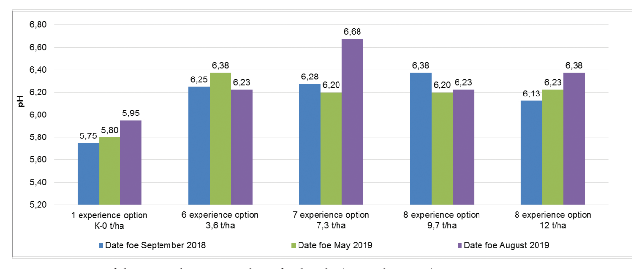
Fig. 3. Dynamics of changes in the average values of soil acidic (September, 2018)