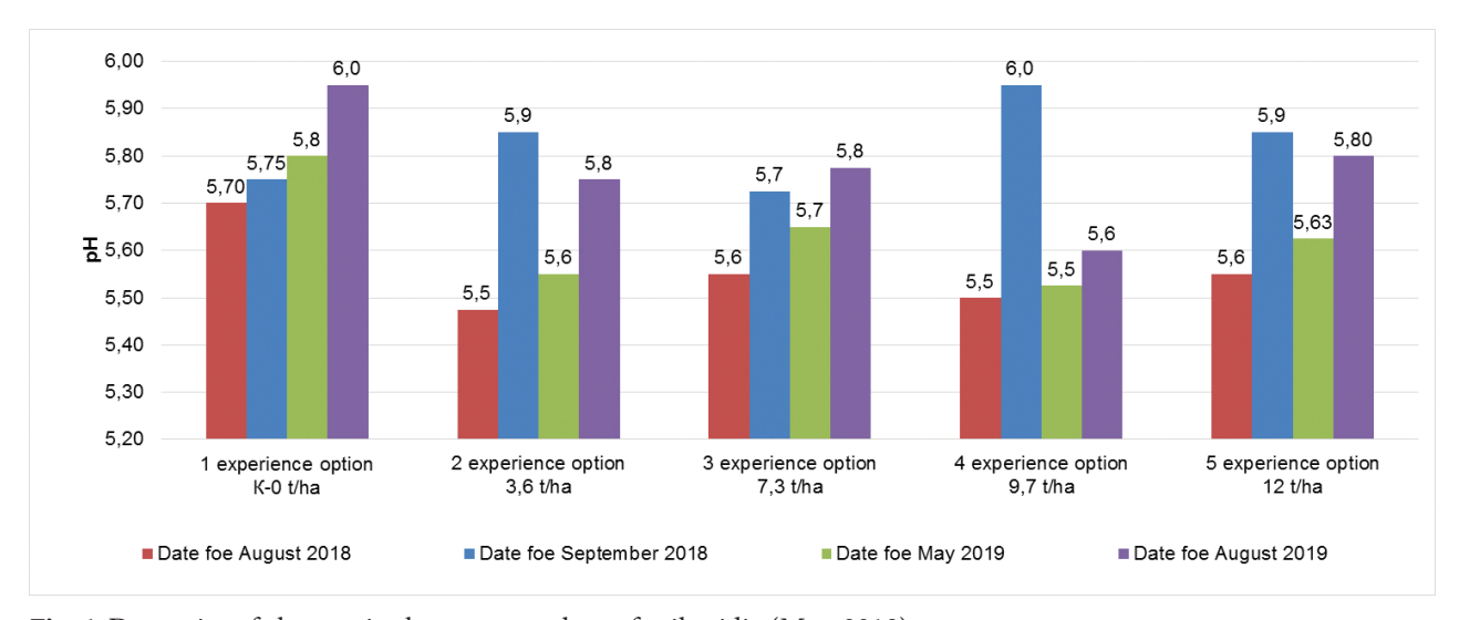
Fig. 1. Dynamics of changes in the average values of soil acidic (May, 2018)

Data on the change in the average value of hydrolytic acidity on the plots with the introduction of sa-