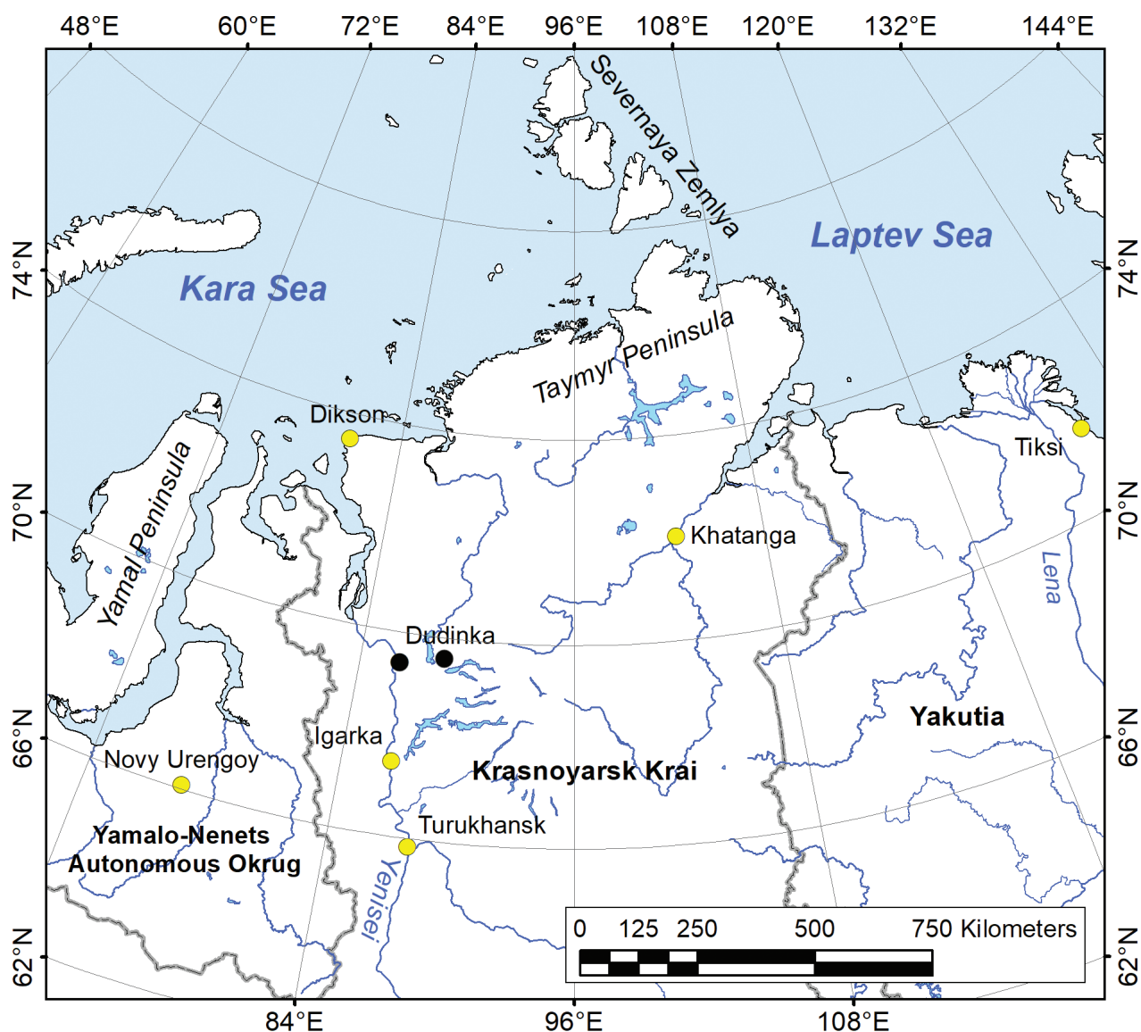
Fig. 1. Map of the Southern Taymyr. Black circles indicate the studied localities