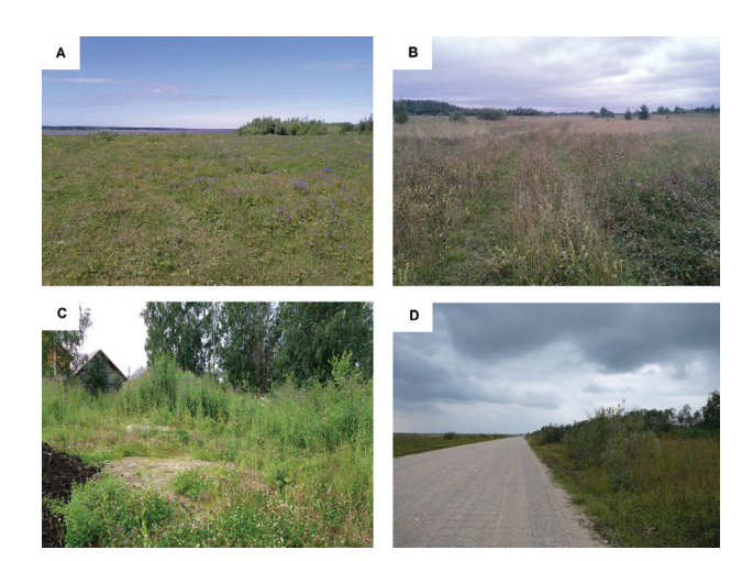
Fig. 2. Typical foraging habitats of B. soroeensis in the Arkhangelsk Region: (A) Wet meadow in floodplain, Mezen; (B) Dry meadow, Shenkursk; (C) Ruderal community, Onega; (D) Roadside, Kholmogory.

meadow in floodplain, dry meadow, ruderal community, roadside near forest, Filippov leg.